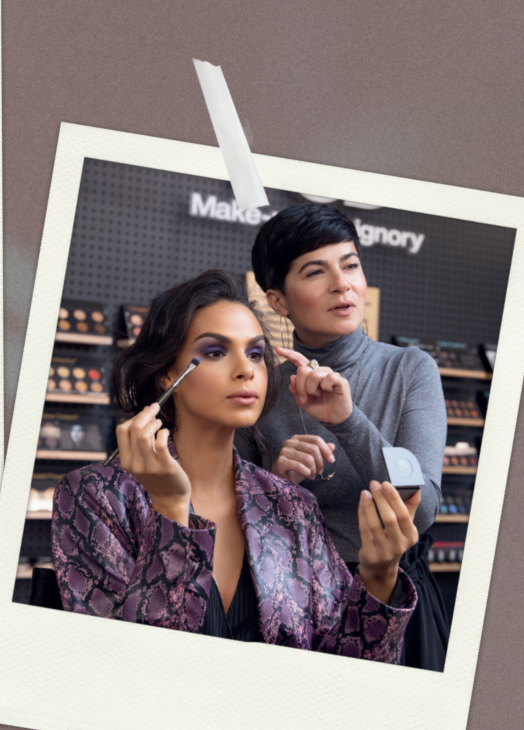
••A leader in the field of make-up artistry education.